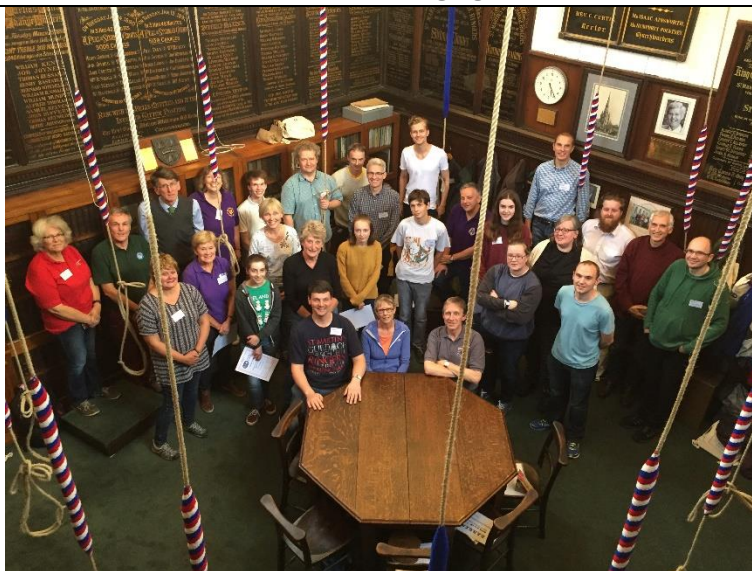
All the students and their tutors with most of the helpers at St Martin's