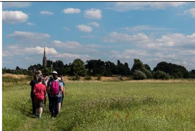
Two actions photographs! The right photograph shows the group approaching the distinctive tower at Kings Sutton, with the sun beating down.

A three kilometre walk took us to the hefty eight at Adderbury, hung in a magnificent medieval church with many fine carvings inside and out (see photograph overleaf). Much needed drinks and a good lunch were had at The Bell Inn before we made our way to Kings Sutton; its one hundred and ninety-eight foot tower and ornate spire visible for miles. Afternoon tea in the nearby Bell House rewarded us at the end of ringing.