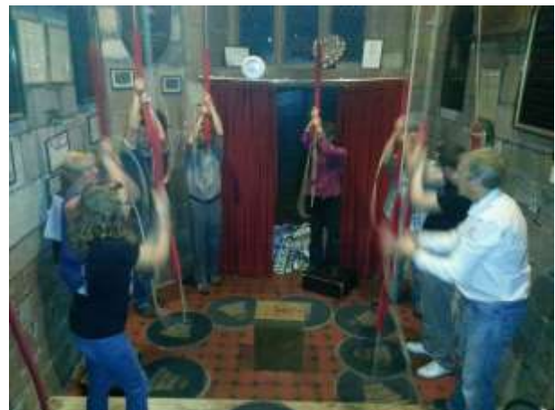
Surprise Major practice at Edgbaston

The six Surprise Major practices organised on Wednesday evenings through the summer were a great success. About 20 members attended some or all of the sessions, with significant progress made across the target methods of the Standard 8, Lessness and Glasgow, and a lot of Spliced.