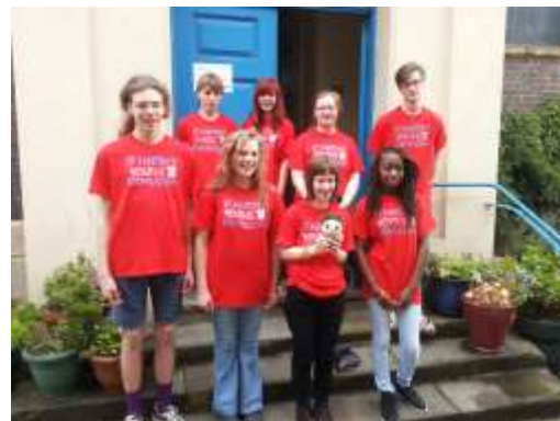
The Team outside Old St Martins