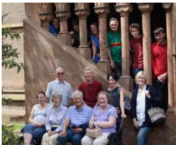
The ringers at Grimley