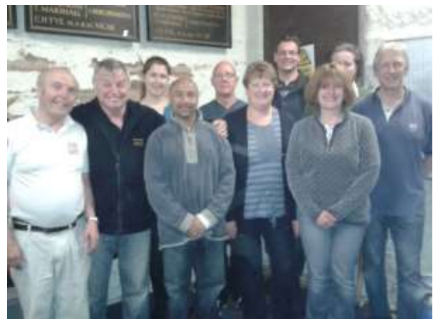
A happy practice at Perry Barr, with regular visitors