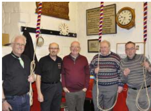
VE Day ringing at Sutton

Casey McLellan has left us to return home to America but sent the following note of appreciation: