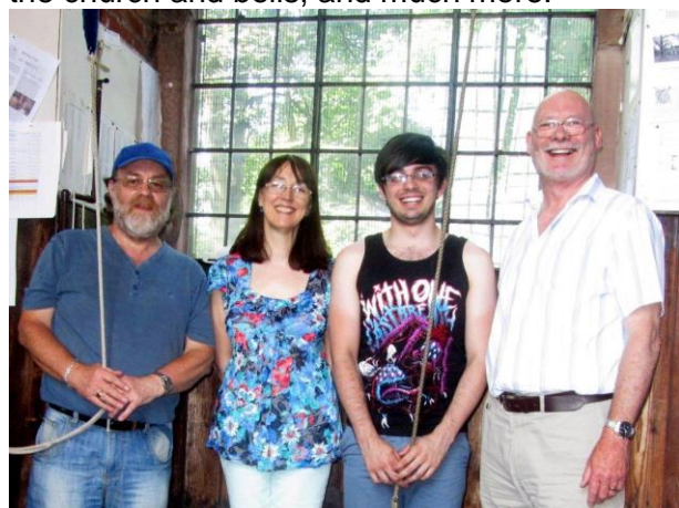
Castle Bromwich project Trustees

It has details of the restoration project, old photographs of the band and ringers, history of the church and bells, and much more.